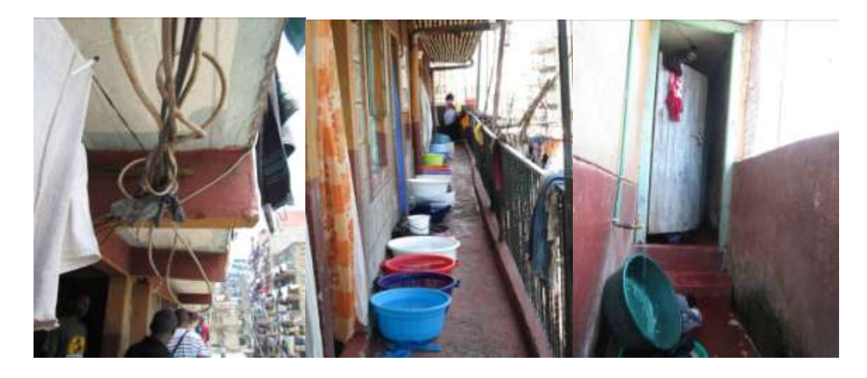
Fig 8-9-10 Electricity, water supply and toilets are not provided by the landlod (photo by Laura Burocco, September 2012)

Due the absence of ordinary electricity connections the residents need to organize an informal connection. Water supply is not guarantee into the units and need to be organized through one pipe for floor located near the one 2 bathrooms per floor available for the residents.