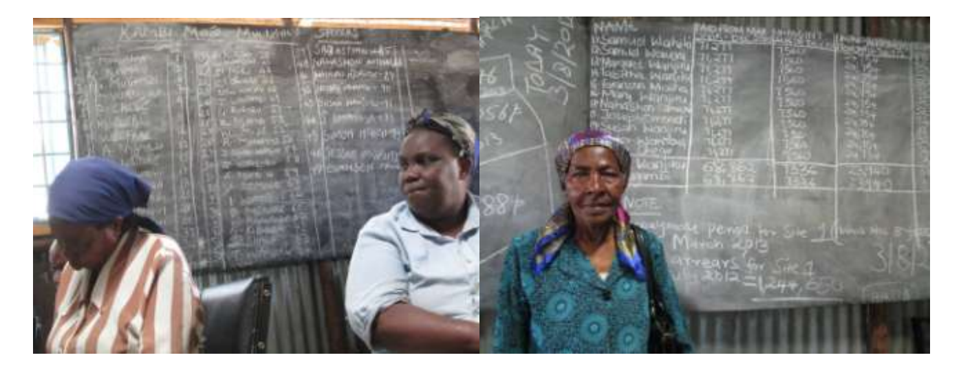
Fig. 3-4 Despite someone allege that poor communities are too disorganize to mobilize resources to put up their own structures the Moto Kambi Project demostre high level of organization and management capacity (photo by Laura Burocco, September 2012)