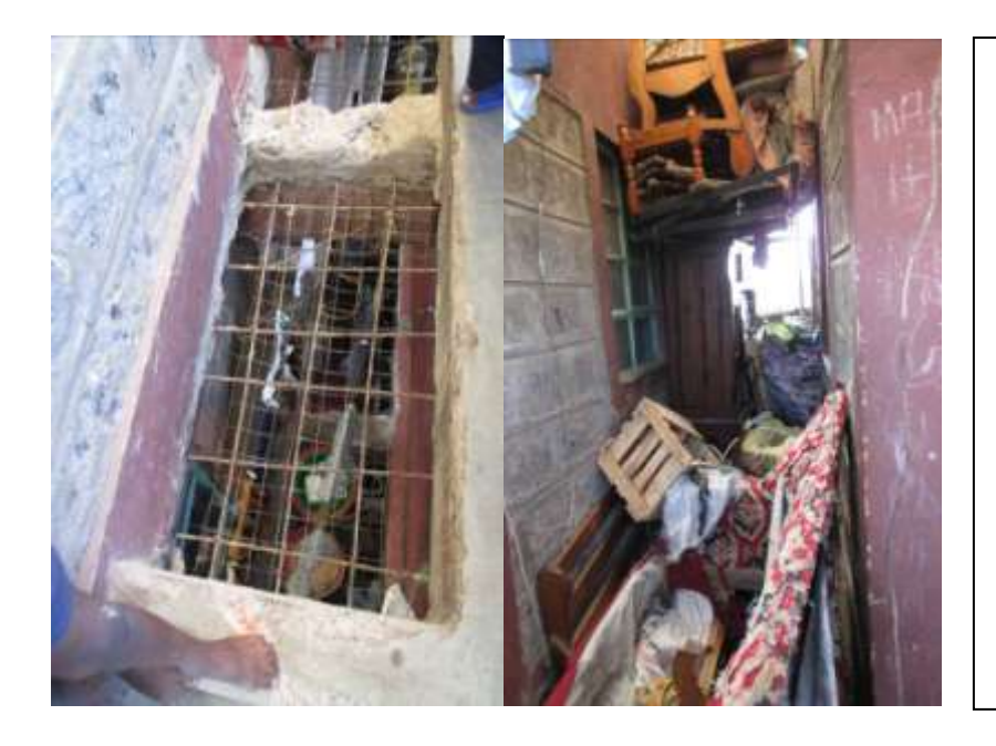
Fig 4-5 Internal and esternal corridors in the building we visited

The only form of ventilation provided in the interior corridor is a open grid present in the pavement of each floor which should facilitate the air's circulation.