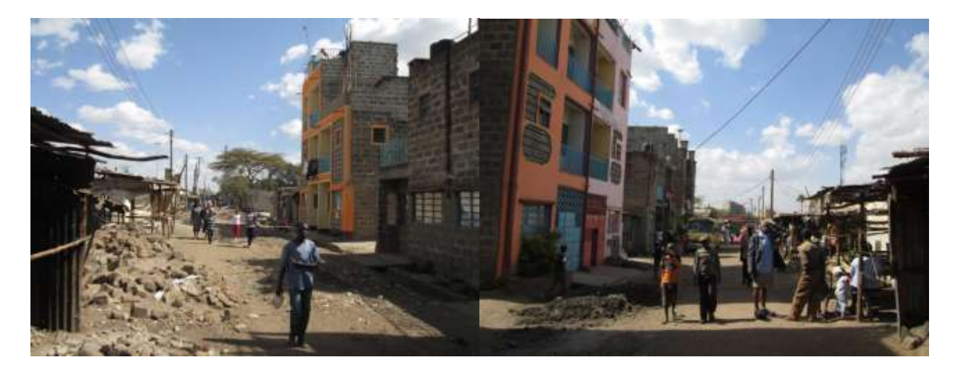
Fig. 14-15 Kambi Moto Housing Project in Huruma, Nairobi

Kambi Moto it is not far from Mathare Valley but present a complete different environment. Mathare as well provide housing for people who needed to live in the city but the condition are completely different. If Mathare provide just a shelter for housing needing people, Kambi Moto reflects a sense of community and of belonging. The engagement of the residents is a crucial element of participation and shows us a slum dweller effort to provide them with descent housing.