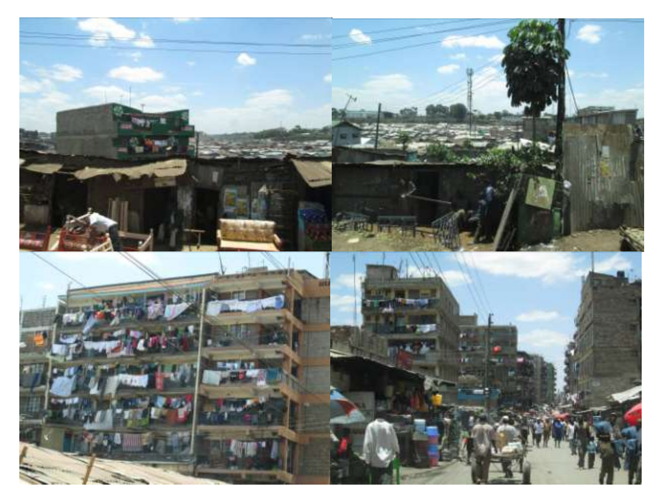
Fig 1-2-3-4 Housing tipology in Mathare

"Mathare Valley is a part of Mathare slum located few kilometers from the centre of Nairobi. The Valley is one of the oldest and worst slum areas in Nairobi and the degree of poverty there is unimaginable. People live in 6 ft. x 8 ft. shanties made of old tin and mud. There are no beds, no electricity, and no running water. People sleep on pieces of cardboard on the dirt floors of the shanties. There are public toilets shared by up to 100 people and residents have to pay to use them. Approximately 600,000 people live in an area of three square miles. Most live on an income of less than a dollar per day. Crime and HIV/AIDs are common". http://en.wikipedia.org/wiki/Mathare_Valley