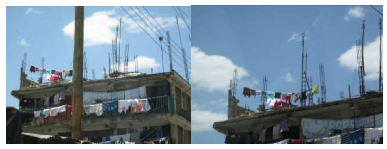
Fig 1-2-3- Despite the precarious conditions homes continue to be enlarged and floors o be added (photo by Laura Burocco, September 2012)