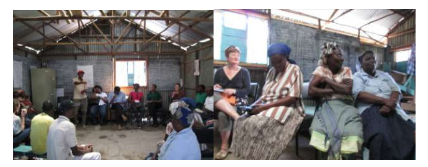
Fig 1-2, Meeting with the members of the Kambi Moto Hosuing Project, Huruma

"The housing project Kambi Moto started in 2003, the residents started making daily saving based on an individual member's ability. Some contribute as little as ten shilling daily. Trough the support of Pamoja Trust and Akiba Mashinani Trust each member was required to save at least 10% of the initial cost of constructing ground floor, a called starter house. This translated into about 7 thousand and 5 hundred shillings. The group through group saving also loaned the member another 10% while Akiba Mashinani Trust loaned the remaining 80%. The beneficiaries started repaying their loans as soon as they occupied the starter houses. 86 members have completed their houses and 56 more units are under construction and will be ready in the next few months". Realizing Right s Though Practice, annual campaign 2012. Published by Pamoja Trust , pp.53-54