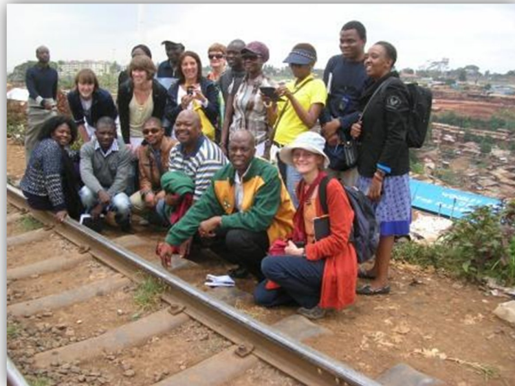
Fig. 1. The group From University of the Witwatersrand that embarked on the trip in a photo with personnel of Umande Trust. In the background, Kibera Informal Settlement. 12/09/12.

We visited Kibera, considered the biggest slum in Africa, the Kenyan National Housing Corporation (NACHU), offices of the UN-Habitat, some tenements in Huruma and an upgraded settlement called Kambi Moto all in Nairobi.