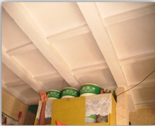
Fig. 14. Innovative construction methods- waffle effect of the ceiling adding to strength and beauty of slab.15/09/12.