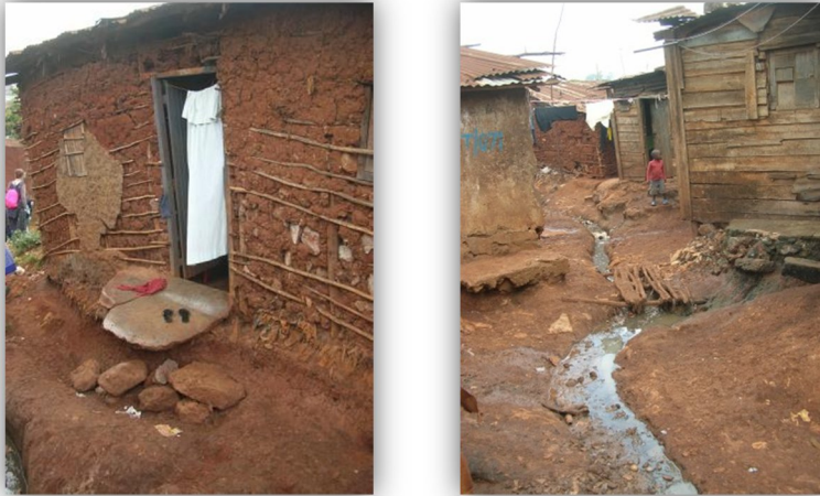
Figs. 4,5,6. Sections of the Kibera settlement above showing the deplorable state of houses and infrastructure. Below (6), the temporary site – formal rental housing provided by government - located nextto the settlement. 12/09/12.

We embarked on a tour through the Kibera settlement to see some of the projects undertaken by the Umande Trust. Ongato ( ibid. ) explained that the settlement has been part of the socio-economic lives of most Nairobians as it has existed for decades. The government is managing it by demolishing but agencies such as Umande Trust assists with incremental upgrading programmes such as the bio-gas projects. The Kenyan government has built flats which act as temporary sites where people whose homes are demolished are given homes for rent whilst they wait to move into permanent formal housing ( ibid. ).