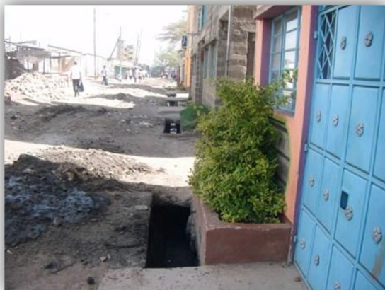
Fig. 16. Open drains showing frequent maintenance.15/09/12.

As most members live on their properties which they contributed to acquire through their own sweat and funds, they see the need for proper maintenance. There is therefore a cleaner environment compared to the surrounding settlements: public refuse bins, open drains that were not choked and some man-made greenery.