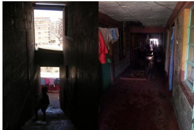
Fig. 12,13. Interior of the dark staircase and corridors. 15/09/12