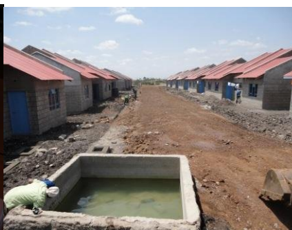
Fig. 8. A Green fields community led housing for 227 members of Faith Foundation Housing.13/09/12.