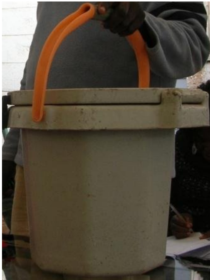
Fig. 2.A 'jitigeme'. 12/09/12.

Discussions centred on how the agency assists communities to manage waste through biogas facilities (about 52 constructed so far). From the onset, communities are involved through capital formation of 60%, then 10% from Sanitation and Development Fund, and 30% from maintenance team (Ongato, Personal Communication, 12/09/12). A caretaker from the community is dispatched daily to maintain each facility where an amount of KSH 5 is paid per use ( ibid. ). Households also pay a monthly fee of KSH150 and can purchase a 'jitigeme' (as shown below) to be used at their convenience which can be emptied at the bio-facility for a fee ( ibid. ). 'Pit latrines' in homes can be connected to the facility at the request of landlords ( ibid. ). The trust makes profit from the operations of the toilet facilities, community bathrooms, meeting halls and spaces for rent which are all constructed as part of the biogas facilities ( ibid. ).