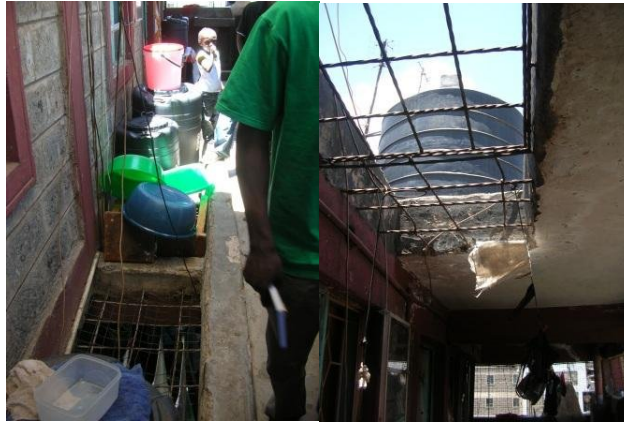
Fig.10,11. Spaces left in roof and on floors to emit sunlight into dark corridors.15/09/12.