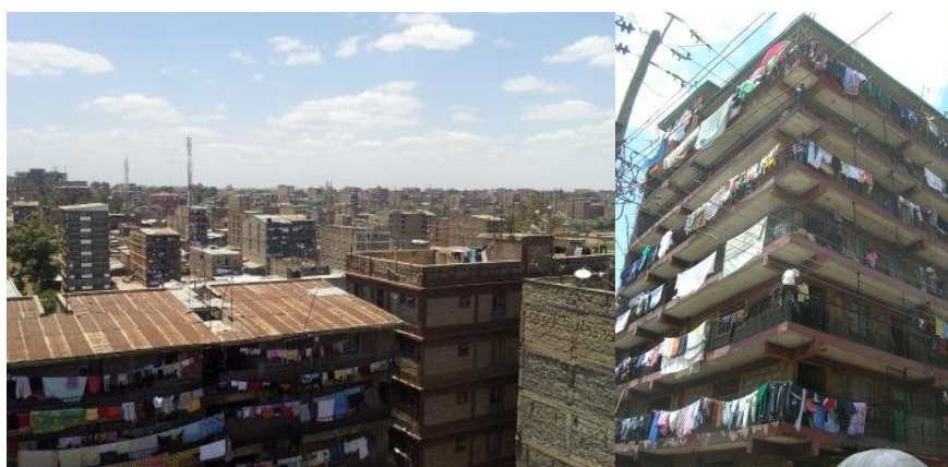
Figs. 8,9. Aerial view of the tenements and close up of another from street, showing drying lines, electrical lines and rusted roofing. 15/09/12.

Then tenements in Huruma have basic facilities such as water and electricity which are rationed, making life difficult. The government can do more by ensuring regular supply of these services. Average amount of KSH3000/month that residents pay for a 12.25m 2 space is not adequate for families. Landlords need to provide less denser housing with spaces for kitchens as in its absence there is high fire risk. In addition, there is no laundry area, open recreational area for children who resort to playing in the narrow corridors, streets, and staircases. This is also dangerous as parental guidance becomes difficult. Lastly, the design of these tenement does not consider the handicapped.