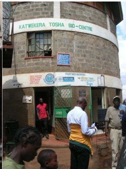
Fig. 3. The first Biogas facility, Katakwera Tosha Centre. 12/09/12.

Key challenges faced by the trust are inaccessible roads to the 'human settlements' which make it difficult for service trucks to access the bio-gas facility and the problem of unregistered community groups which make it difficult for such groups to partake in sustainable projects such as the one offered by Umande Trust.