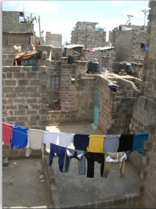
Fig. 18. View from one of the homes showing vertical incremental construction. 15/09/12