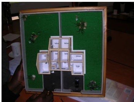
Fig. 7. A typical model of a semi-detached house design which can be developed incrementally. 13/09/12.

A typical example of a project undertaken is one which involved a group of people who were displaced after the post-election violence in 1992 (Kamau, personal communication, 13/09/12). The group approached NACHU with their capital in the form of land ( ibid. ). NACHU provided support through finance sourcing, technical advice, construction to completion of project after which the project was left to the co-operative to maintain ( ibid. ). At that stage, individual owners get titles to their homes and land ( ibid. ). Most co-operatives rarely default on loans as the value of properties increase upon completion of project ( ibid. ). Also buildings are constructed such that they can be incrementally developed.