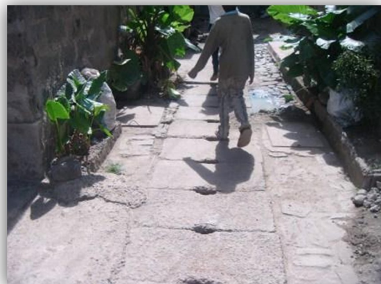
Fig. 17. Man-made greenery and cleaner environment.15/09/12.